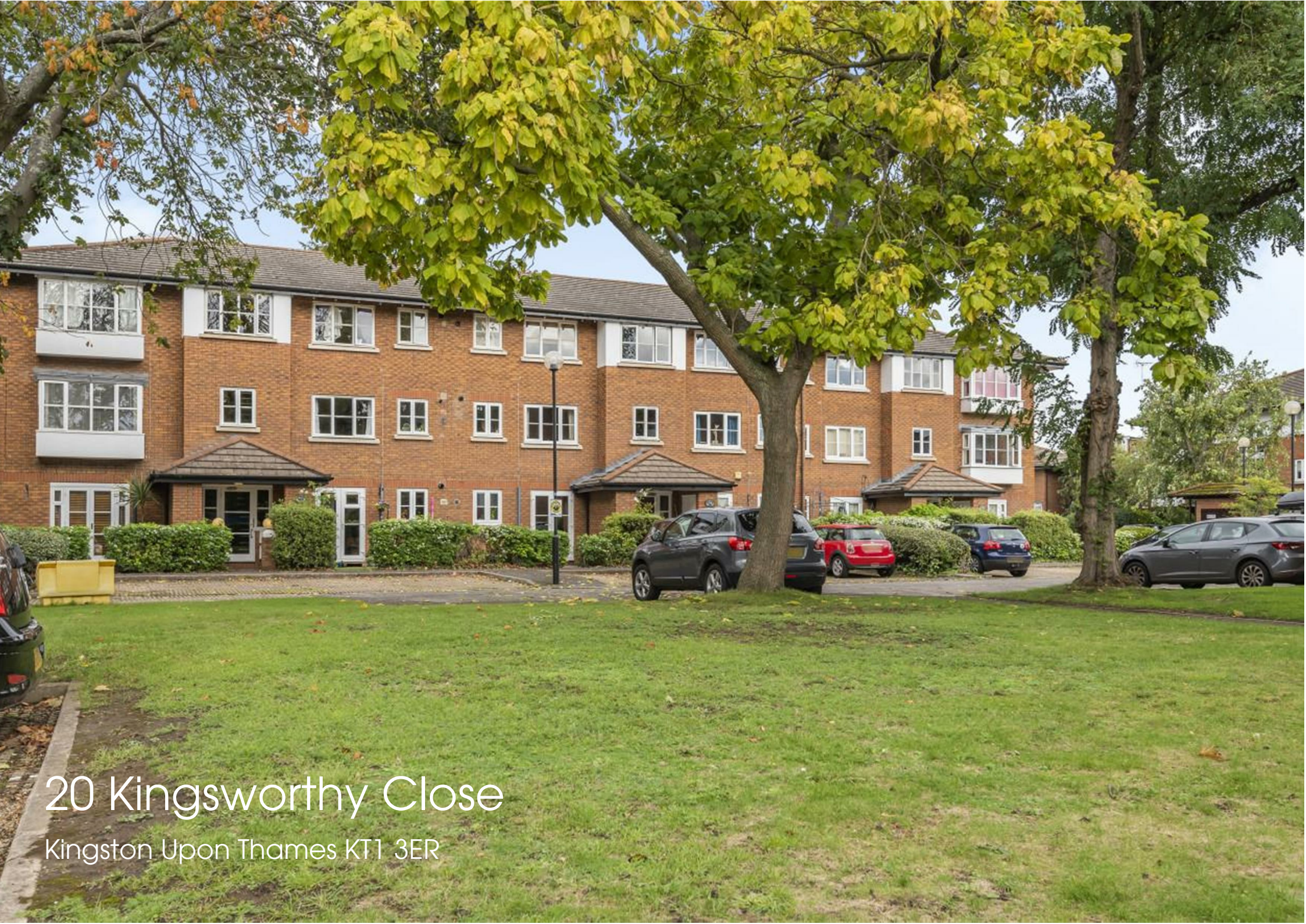
20 Kingsworthy Close Kingston Upon Thames KT1 3ER